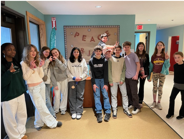
Students at MSM Winter Retreat 2025