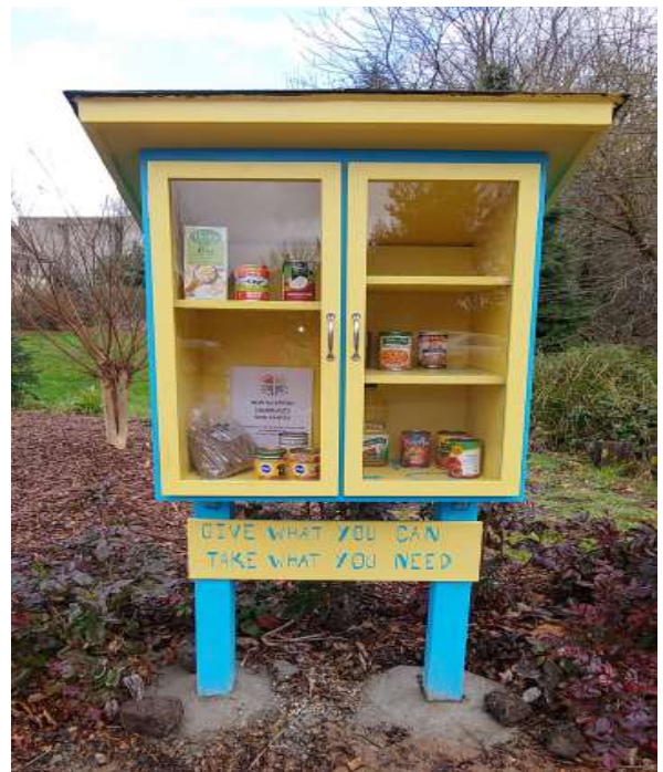
"Give What You Can. Take What You Need"