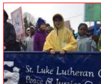
Civil Rights March