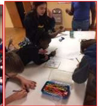
Working on the Creed