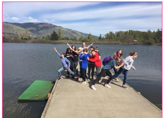
Confirmands on Retreat in Hood River